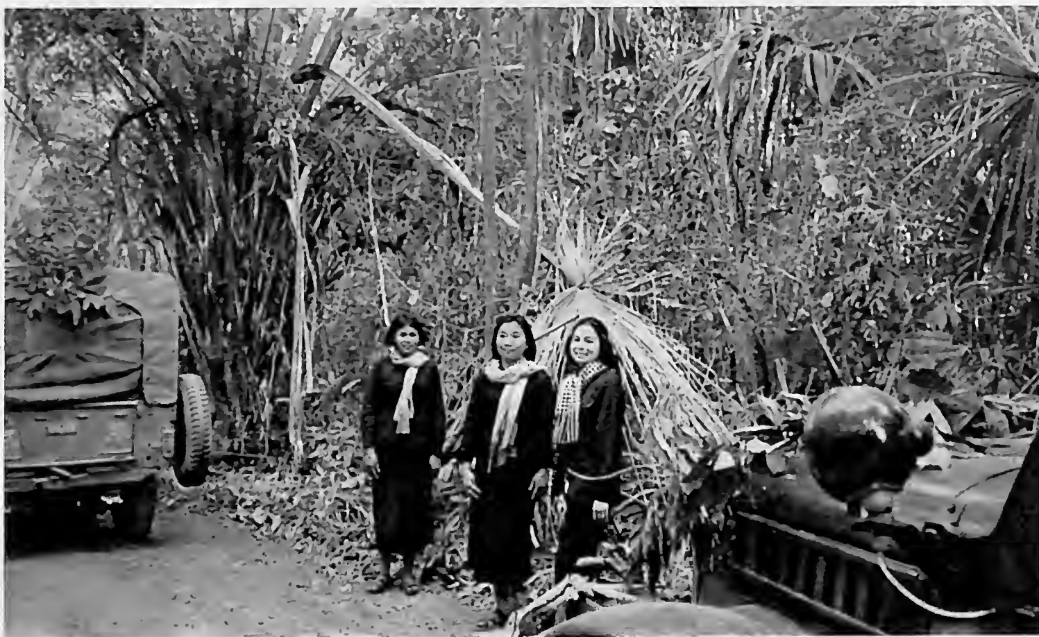
Madame Sihanouk, Madame Hou Yuon and a N.U.F.C. member.